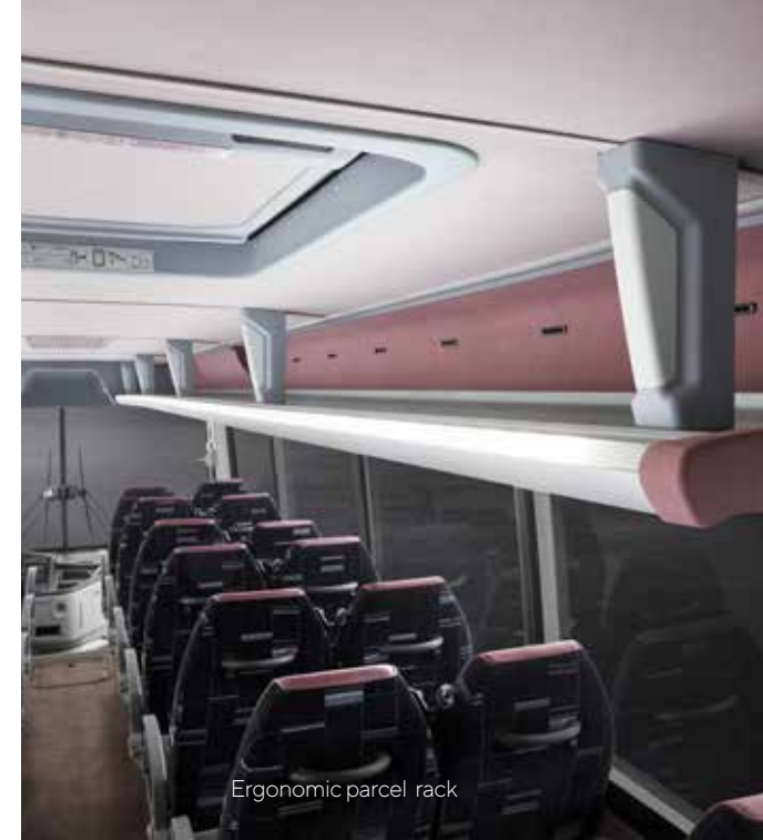
Ergonomic parcel rack

design, powerful air conditioning system, and the restroom. The new TS30 is set to meet your expectations with its seating arrangements, legroom, and distinctive flooring patterns and color options.