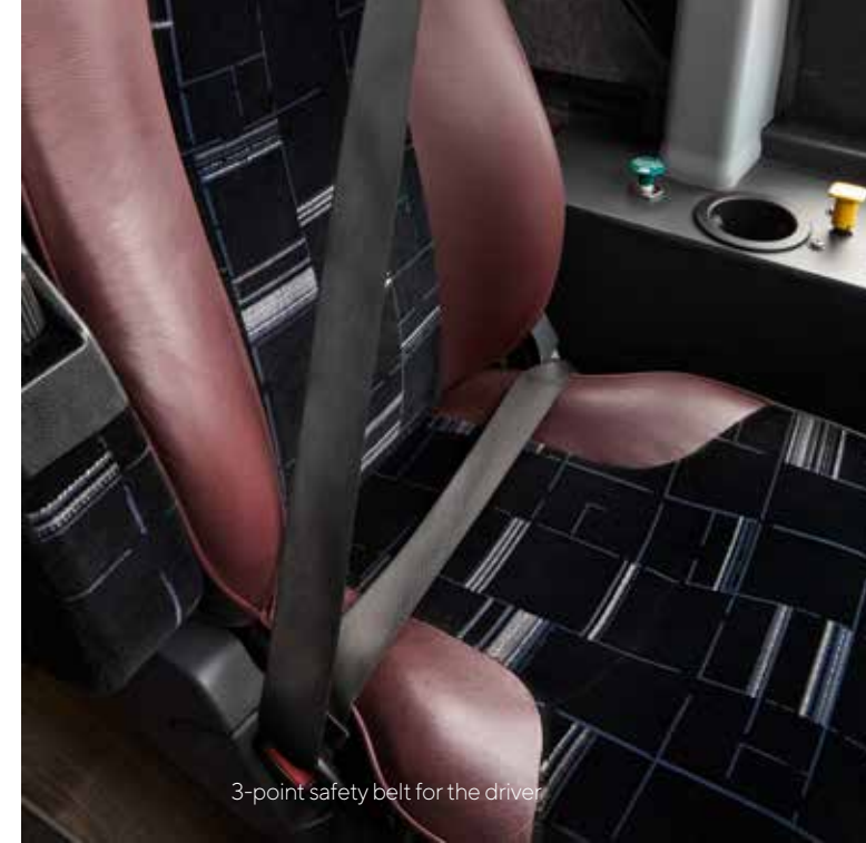
3-point safety belt for the driver

giving the vehicle a lighting system that makes it noticeable to other vehicles. Features such as cruise control, low voltage warning, and a circuit separator on the battery help make each trip safer.