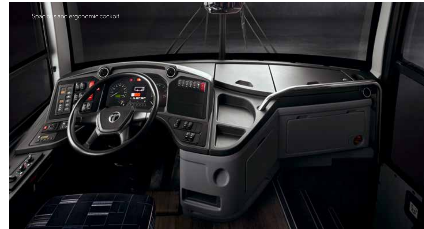
Spacious and ergonomic cockpit