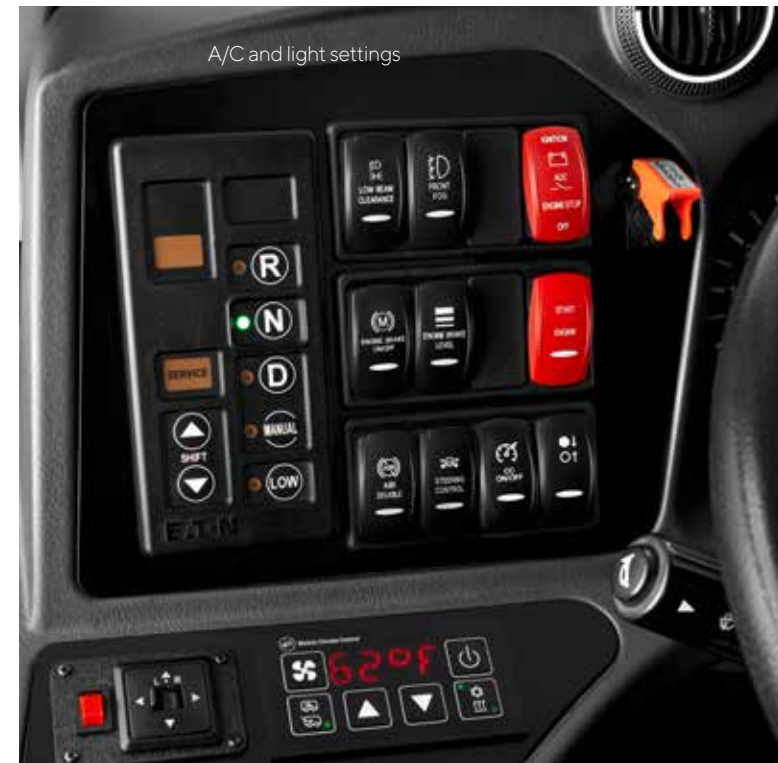
A/C and light settings