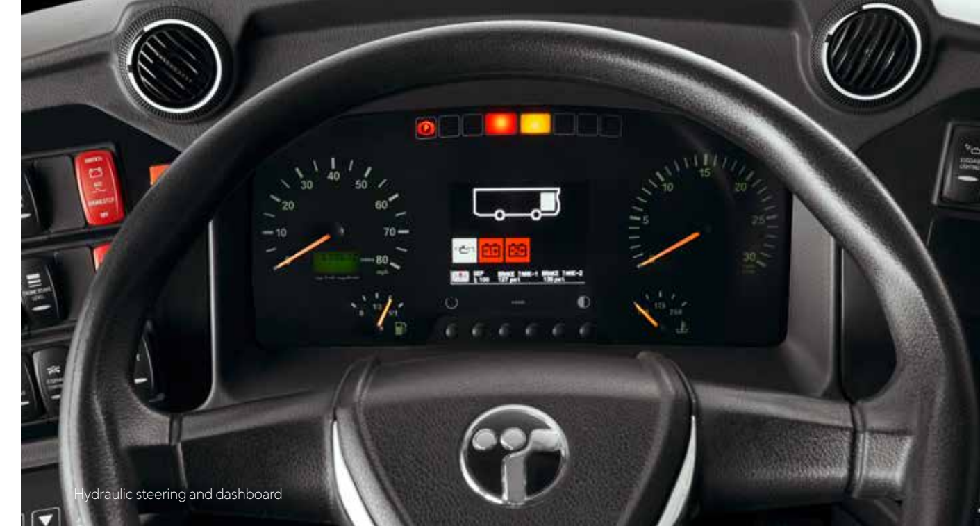
Hydraulic steering and dashboard