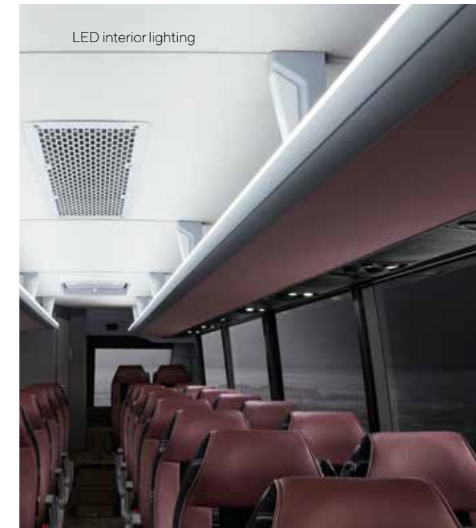
LED interior lighting