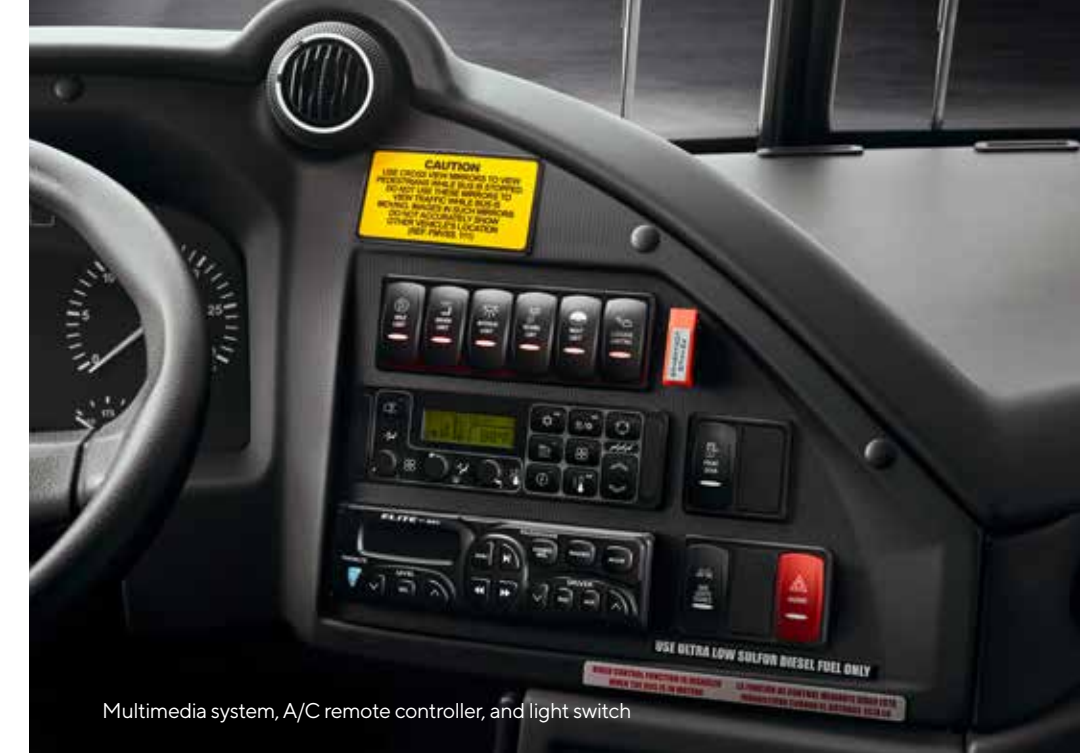
Multimedia system, A/C remote controller, and light switch