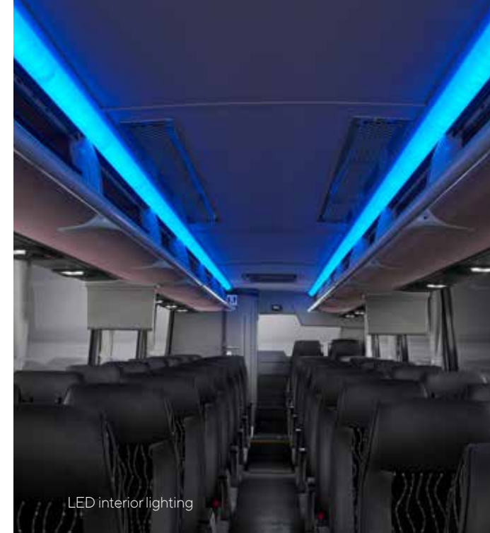
LED interior lighting

All you need to is to choose the space between seats and the layout, pattern, and color of the floor.