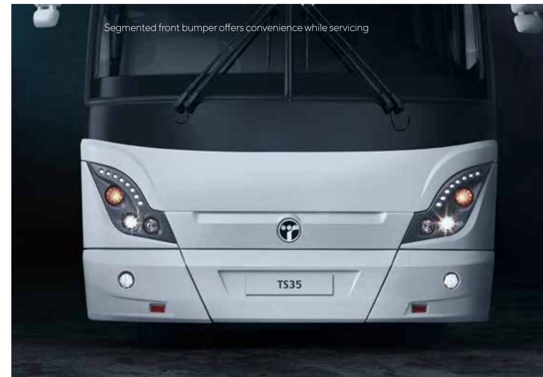
Segmented front bumper offers convenience while servicing