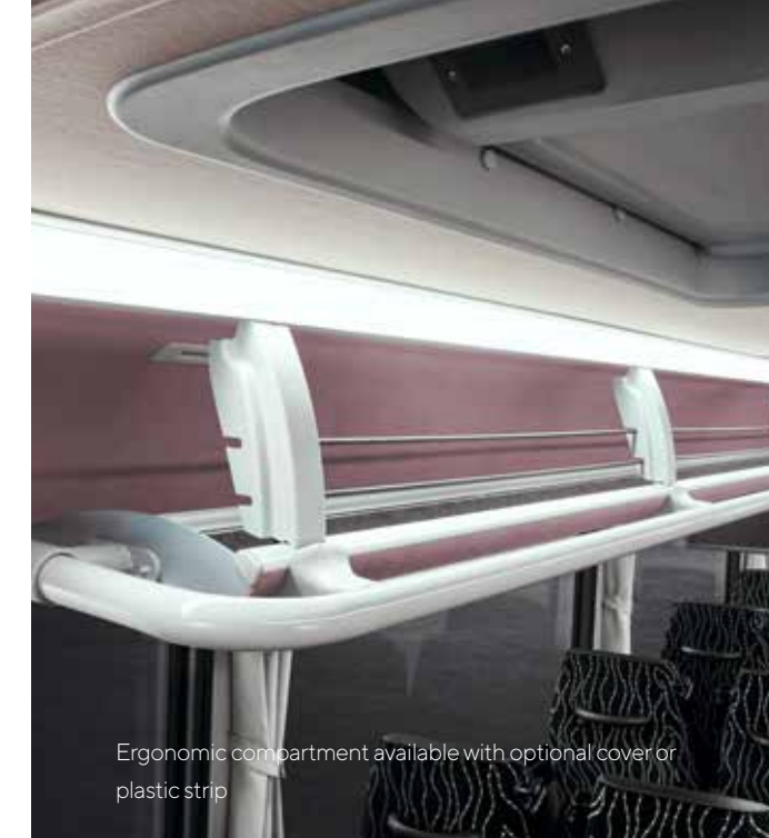
Ergonomic compartment available with optional cover or plastic strip