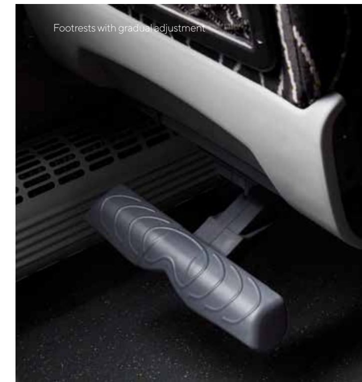
Footrests with gradual adjustment