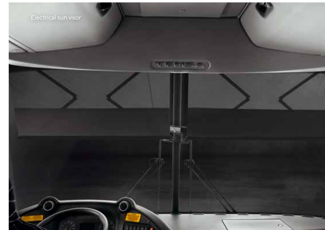
Electrical sun visor