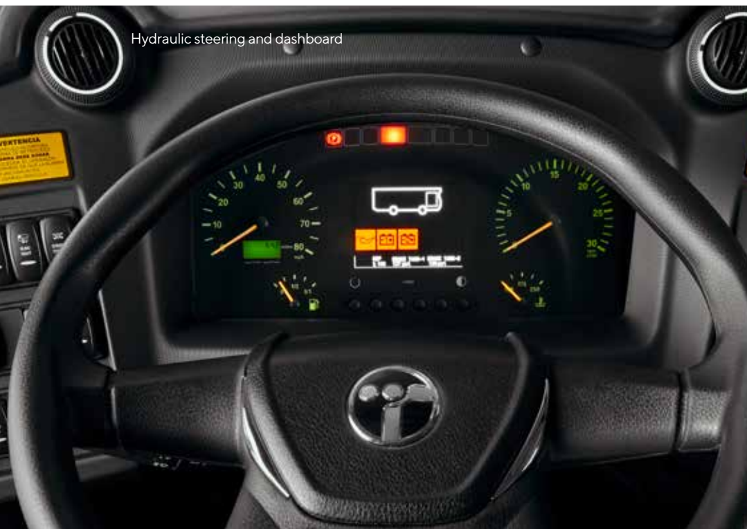
Hydraulic steering and dashboard