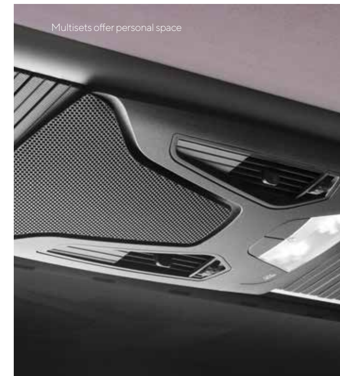
Multisets offer personal space