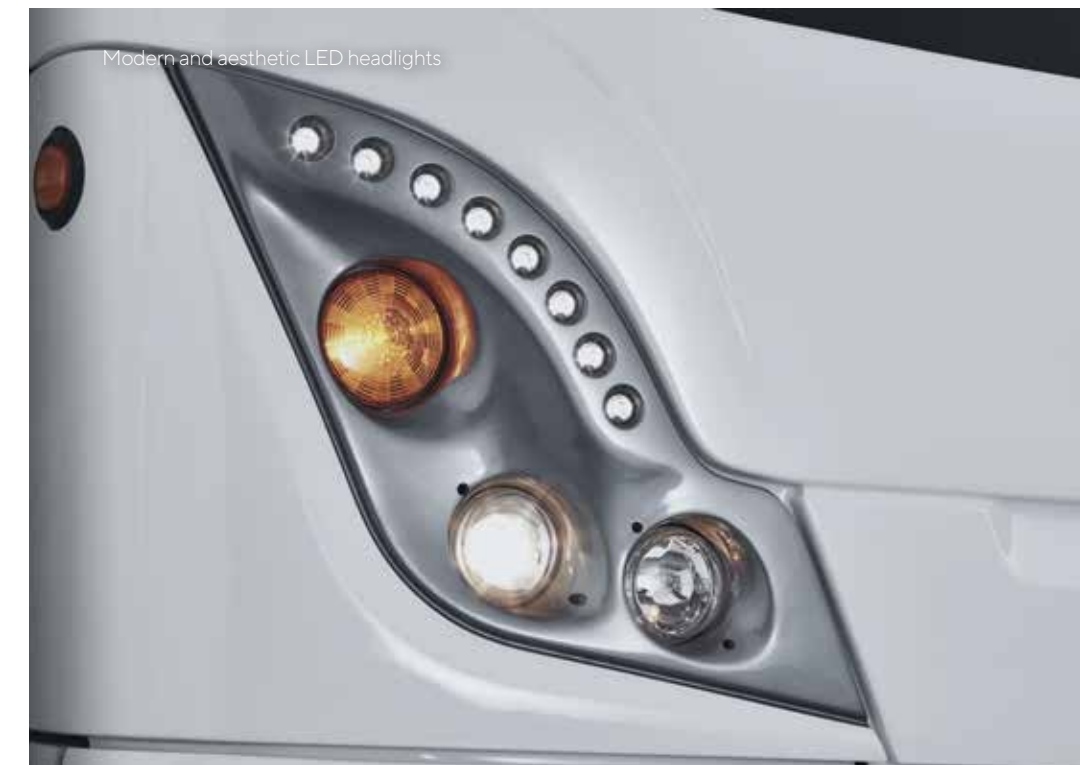
Modern and aesthetic LED headlights