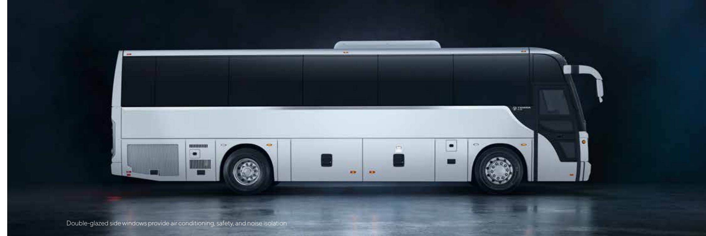
Double-glazed side windows provide air conditioning, safety, and noise isolation

easy access to the items you need and perform numerous service-related tasks without even moving an inch. The TS35 comes in many colors to meet your needs.